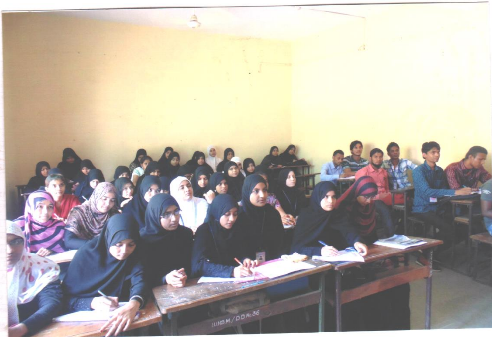
Participants in the workshop.