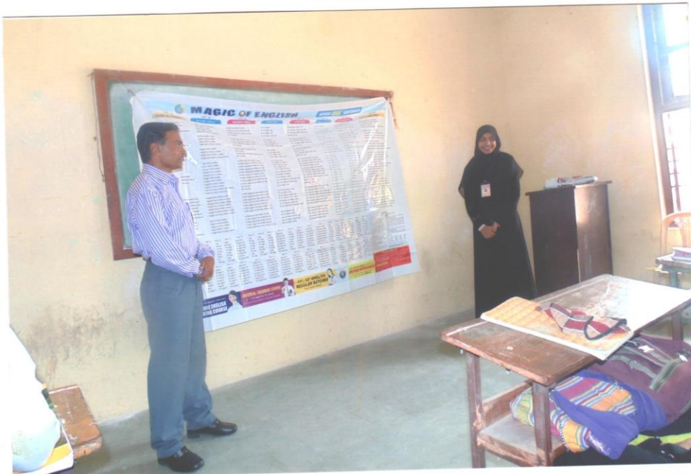
A student expressing her views.