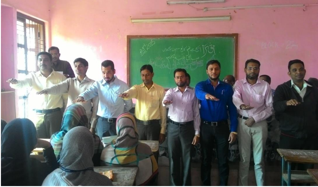
Installation of Alumni Association 23/12/2015