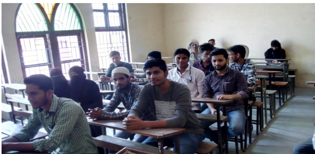
Alumni Association meeting 09/02/2018