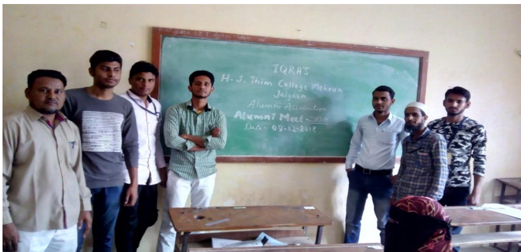
Alumni Association meeting 09/02/2018