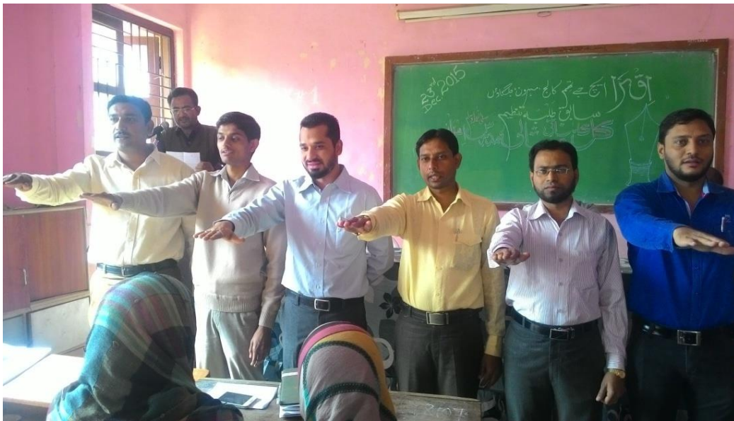
Installation of Alumni Association 23/12/2015