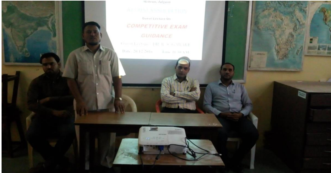
Guest Lecture for Alumni Association 20/12/2016