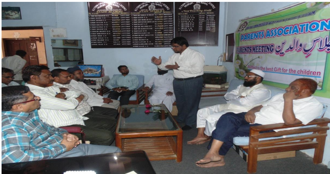
Parents meeting on 04 th Jan.2018