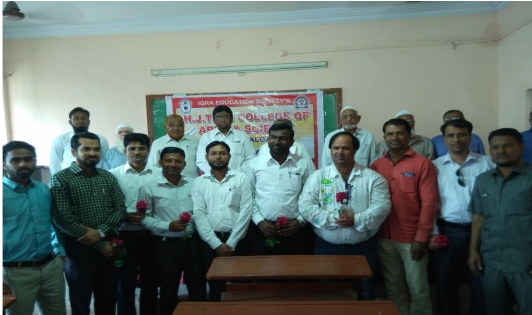
Alumni Association Installation with President & members & College staff. On 21/12/2017