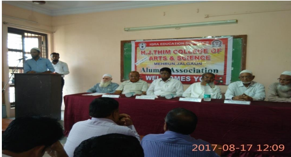
Alumni Association Program Started With Tilawat- E- Quran on 17/08/2017