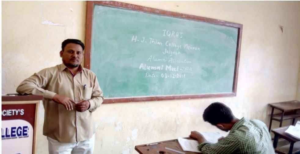
Alumni Association meeting 09/02/2018